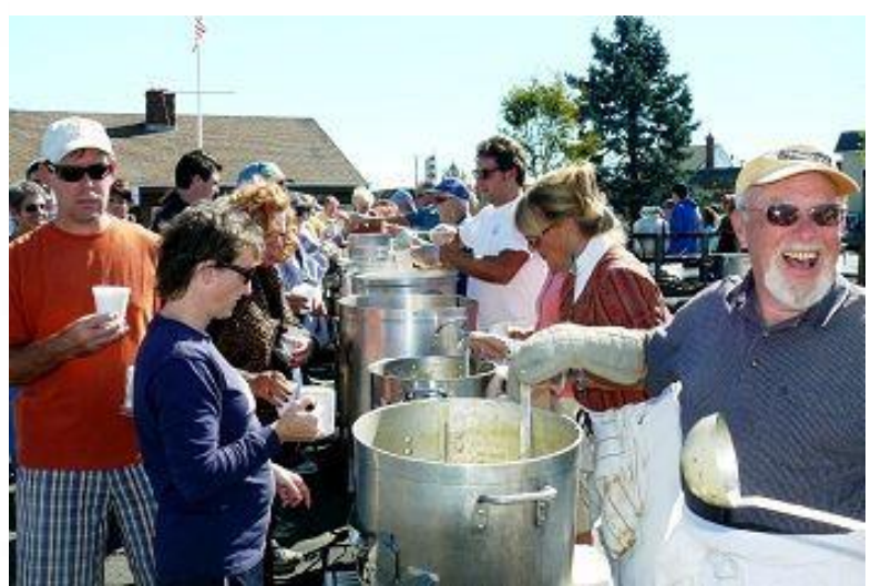
Chowder contest ladlers.

Montauk's 38th Annual Fall Family Festival and Chowder Contest sponsored by Montauk Chamber of Commerce, returns October 12 to 13 on Columbus Day Weekend. It draws hundreds of visitors and East Enders each year to downtown and throughout Montauk. The Fall Festival is the chamber's major annual fundraiser since 1981.